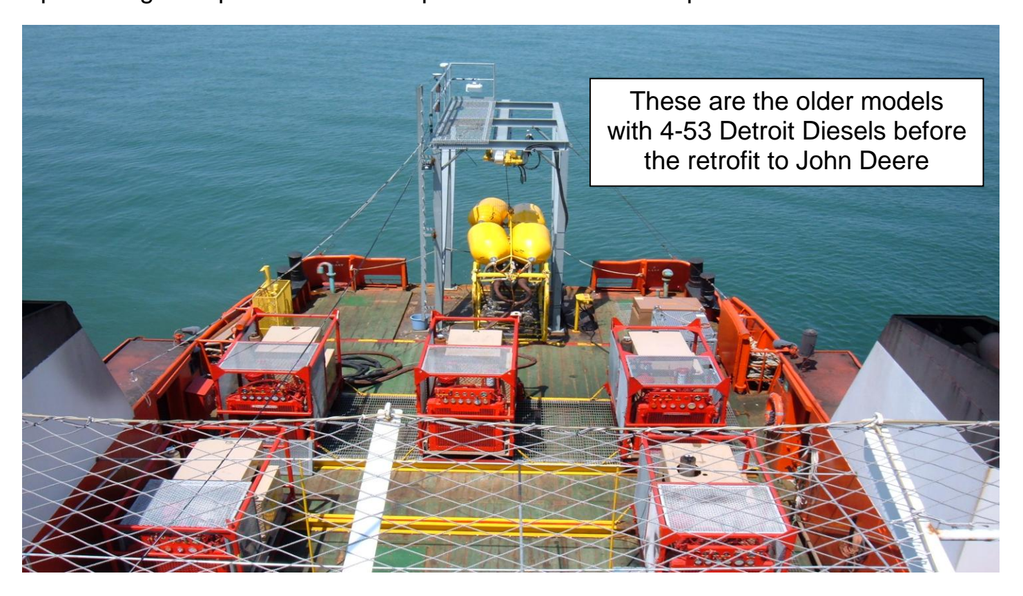
Five Stark Compressors aboard M/V Britannia Uno Offshore Cameroon West Africa 2005

The cage protects the package from shipping and mobilization damage as well as protecting the operators from the possible hazard of component failure.